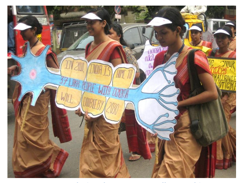
A moment during the Memory Walk at Cochin

• Get the walkers to carry balloons, posters and banners and distribute information about dementia.