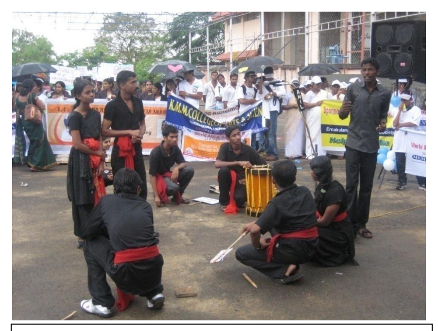
Street play, ARDSI Cochin chapter conducted WAD

defined objectives achieved? What was a success and what are your