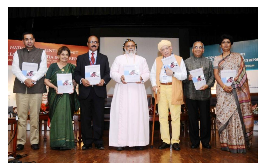
Release of Dementia India Report 2010

allocate health and welfare resources for the future. There has fundamental awareness be among policy makers, clinicians and the public and more community based services, welfare and support at an accelerated pace. Many developed countries like USA, UK, France, Australia, New Zealand and Canada have National Dementia Strategies and Dementia Programmes for their countries. In Asia, some of the countries that are developing a National Dementia Programme are Japan, Singapore and Korea.