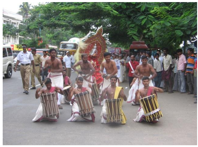
Shinkarimelam made the Memory Walk at Cochin colorful

Photographs can make all the difference, especially in local newspapers: a story is much more likely to be printed with a good photo. Even just a photo with a caption is a good way to get coverage. Get to know a local photographer with news experience, and build up a bank of good pictures. Good visuals are central to successful television coverage too so think about a good picture-opportunity if you're targeting television.