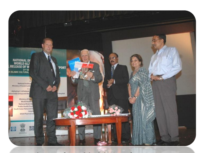
Release of World Alzheimer's Report

An unwieldy group can make everyone uncomfortable, distract from your message, and waste valuable time getting set up. Make certain that the group has already decided on a spokesperson and stick with that decision.