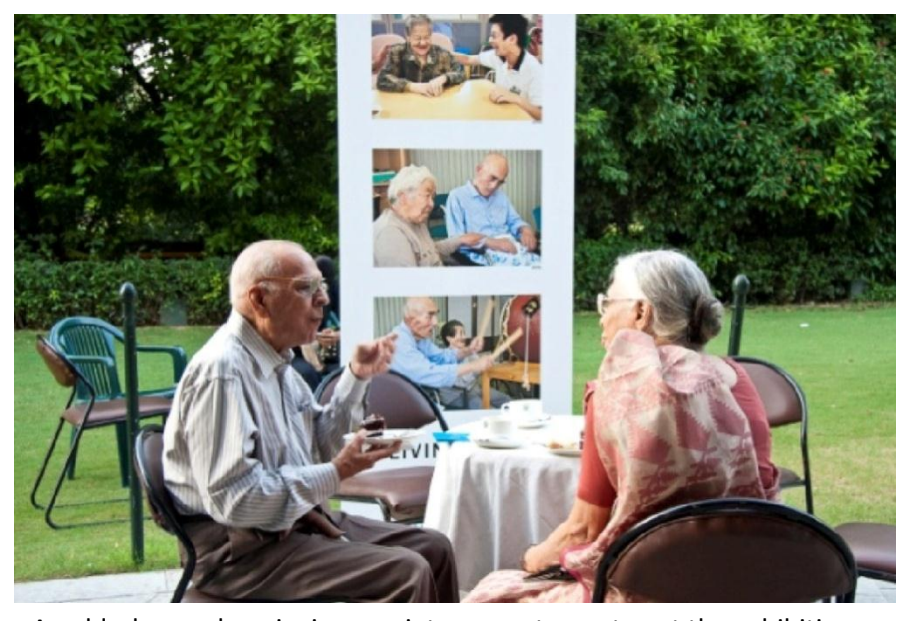
An elderly couple enjoying a quiet moment over tea at the exhibition

Every interview presents a golden opportunity to communicate your position to a large number of people. In thoroughly preparing your brief you are preparing the messages you are going to get across to the audience.